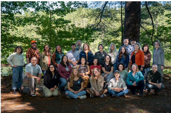
CRC Staff in Norwich, VT, in September, 2025.

Below are some of the people behind the mission. You can find the complete and current list of the staff and Board of Trustees at ctriver.org/staff and ctriver.org/board respectively.