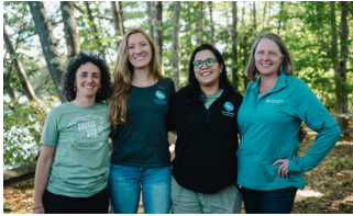
ADVOCACY & POLICY

The Connecticut River Conservancy is fortunate to have a remarkable staff and Board of Trustees stewarding programmatic and operational work. Here is a listing of our programs: