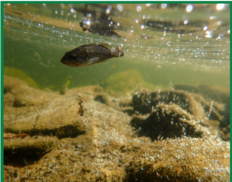
A diverse array of life underwater in the Connecticut River watershed. Top to bottom: Physid snail, sea lamprey, Eastern elliptio mussel, young smallmouth bass.

The Connecticut River watershed has abundant forests, rivers, wildlife, and spaces to enjoy the outdoors. However, the combined challenges of accumulating pollutants, outdated infrastructure, increased development, severe weather events, and threats to biodiversity mean there is work to do to ensure the future ecological health of the bioregion. Building upon CRC's prior restoration successes and staff expertise, we will continue to focus on improving the ecological condition of riparian and aquatic areas. These efforts seek to mitigate human impacts and to enhance life on, in, and near the river for people and nature.