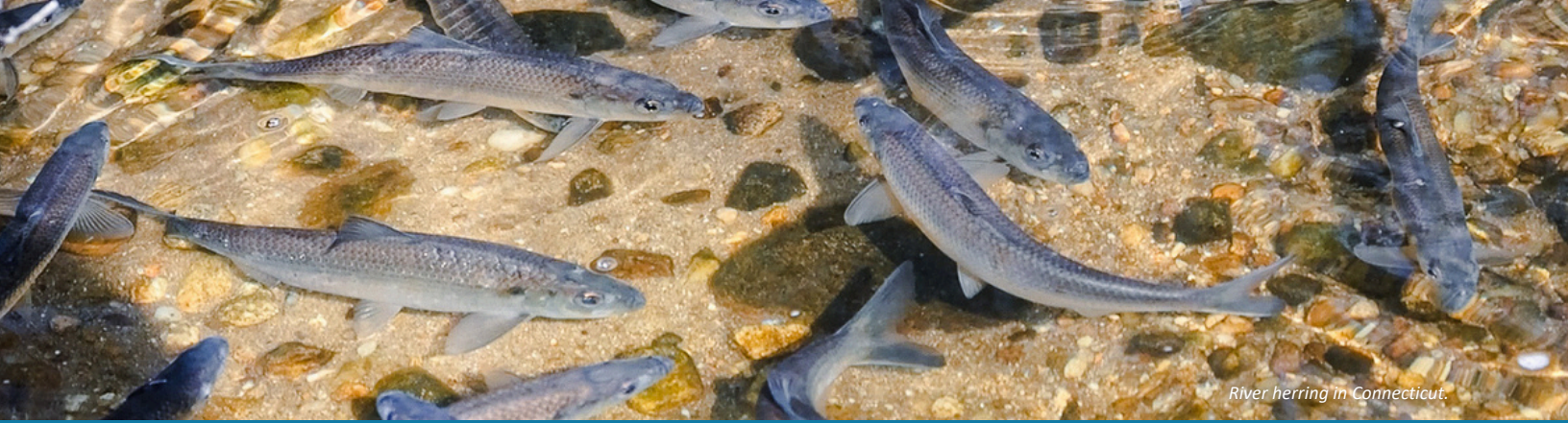
River herring in Connecticut.