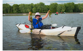
AQUATIC INVASIVE SPECIES