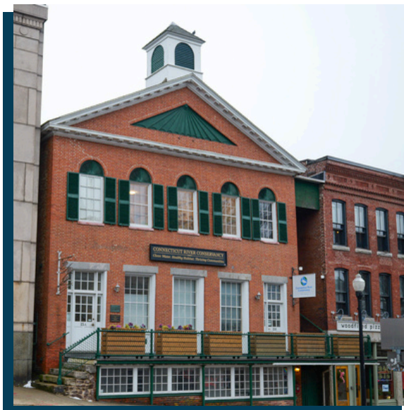
CRC's office and water quality lab in a historic building that was previously the First Franklin County Courthouse dating back to 1813.