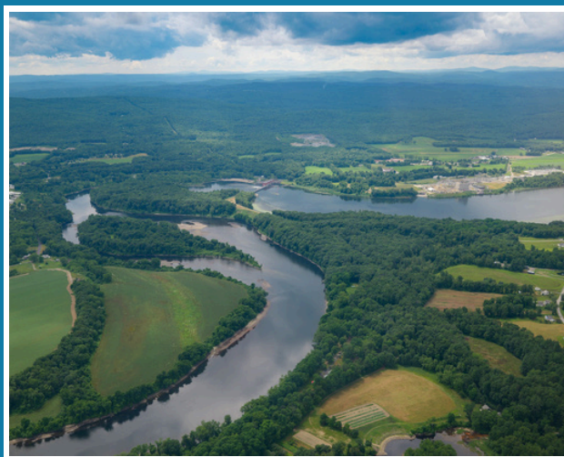
The Connecticut River in Vernon, VT, with the Vernon Dam in the background. Flight support by LightHawk.

CRC's impact is powered by talented staff who implement projects in New Hampshire, Vermont, Massachusetts, and Connecticut, as well as extraordinary partners and volunteers. As we approach our 75th anniversary, we continue to take the long view of the river, applying technical solutions and hard-won wisdom to complex intra- and interstate challenges. Grounded in science, driven by community, and focused on results, this strategic plan is a roadmap for collective action to protect and restore the river we call home.