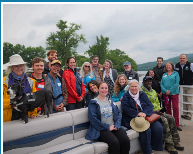
CRC's Annual Meeting in 2025 with staff, guests, volunteers, and partners on the Connecticut River in South Hadley, MA.