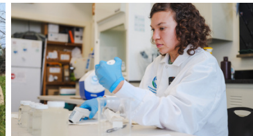
WATER QUALITY MONITORING

Below are some of the people behind the mission. You can find the complete and current list of the staff and Board of Trustees at ctriver.org/staff and ctriver.org/board respectively.