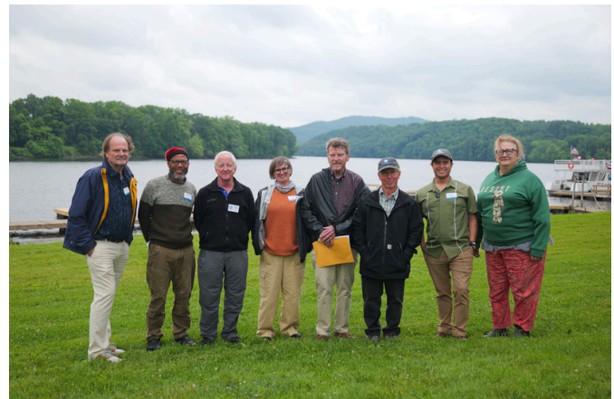
Partial group of CRC's Board of Trustees in South Hadley, MA, in June, 2025.

BE PART OF THE SOLUTION FOR CLEANER RIVERS. VISIT CTRIVER.ORG .