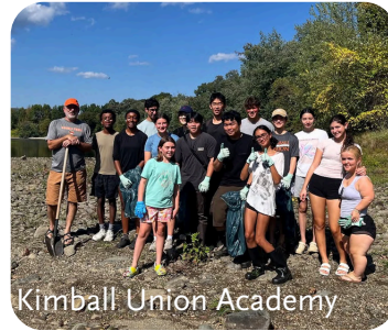
Kimball Union Academy