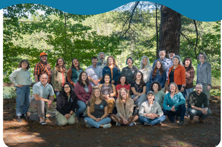
Connecticut River Conservancy staff in 2025

THANK YOU for all you do for our rivers. While the Source to Sea Cleanup is a major annual event, the work of the Connecticut River Conservancy and our many regional partners happens all year round. From removing obsolete dams and aquatic invasive species to advocating for better policies and testing water quality in our lab, we take a watershed-wide approach to just about everything. Your support makes it possible!