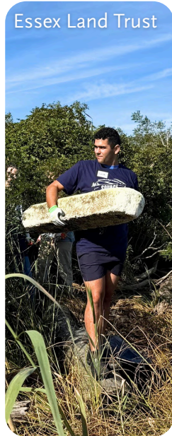
Essex Land Trust