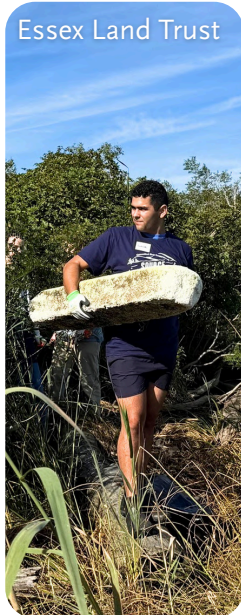
Essex Land Trust