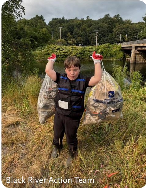
Black River Action Team