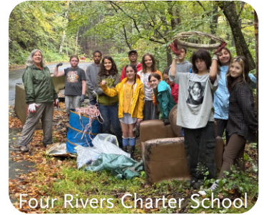
Four Rivers Charter School