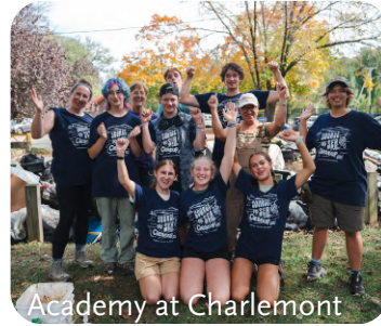
Academy at Charlemont