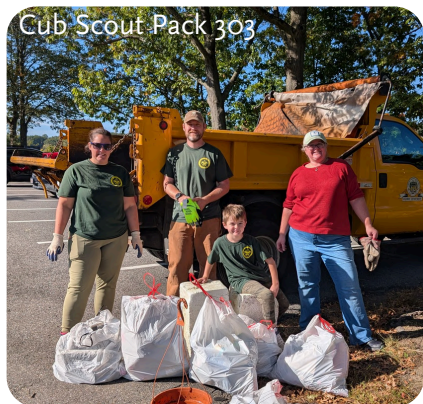
Cub Scout Pack 303