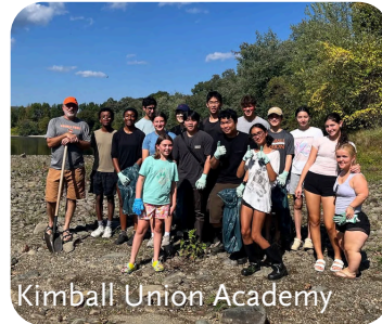
Kimball Union Academy