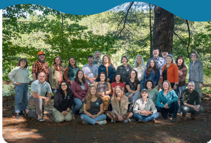
Connecticut River Conservancy staff in 2025

THANK YOU for all you do for our rivers. While the Source to Sea Cleanup is a major annual event, the work of the Connecticut River Conservancy and our many regional partners happens all year round. From removing obsolete dams and aquatic invasive species to advocating for better policies and testing water quality in our lab, we take a watershed-wide approach to just about everything. Your support makes it possible!