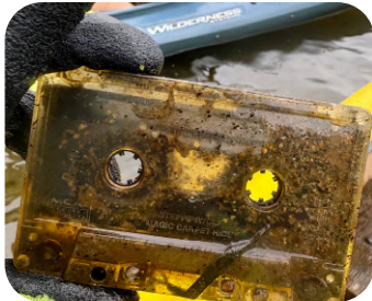
Steppenwolf 1969 Magic Carpet Ride