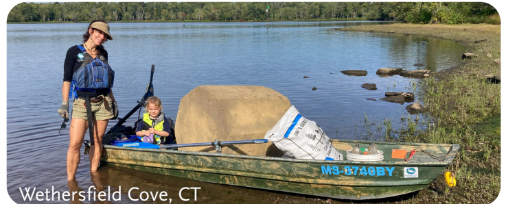
Wethersfield Cove, CT